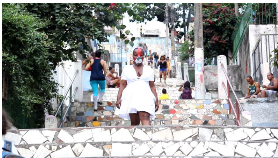
Figure 2 - Excerpt from the documentary film Experimentando o Vermelho em Dilúvio [Experiencing Red in Deluge], by the artist MuSa Michelle Mattiuzzi. Photographer: Matheus Ah. (2016). Source: https://www.studiomusa.art/performance/experimentando-o-vermelho-em-diluvio/

against slavery in the 17th century and after whom the public sculpture is titled. It is noteworthy that this study examines the utilisation of public spaces by artistic monuments and how it aligns with the purpose of street art, as defined by Riggle, who states, "An artwork is street art if, and only if, its material use of the street is internal to its meaning" (Riggle, 2010, p. 246). Therefore, the artist employs a metalanguage to produce street art. She positions a publicly accessible monument in her film to scrutinize it, thus returning it to public space through an artistic action.