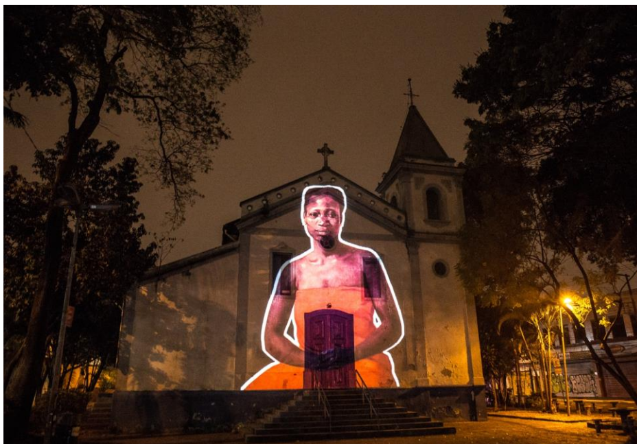
Figure 3: Tereza de Benguela, by Coletores Collective. São Paulo, Nossa Senhora dos Homens Pretos Church (2020). Video mapping technique.

The CURA - Urban Art Circuit held in Belo Horizonte in 2020 and 2021 was a highly impactful urban art project during the pandemic. As one of the country's largest urban art festivals, CURA had already conducted eight editions, with the last two during the pandemic dedicated to the decolonial agenda. The acronym CURA is derived from the Portuguese word for "healing" and represents one of the chief slogans of decolonial art, which asserts that art can assuage experiences injured by colonialism. These editions included Indigenous and Black artists as curators, specifically Arissana Pataxó and Domitila de Paulo in 2020, and Naine Terena and Flaviana Lasan in 2021. (Figure 4)