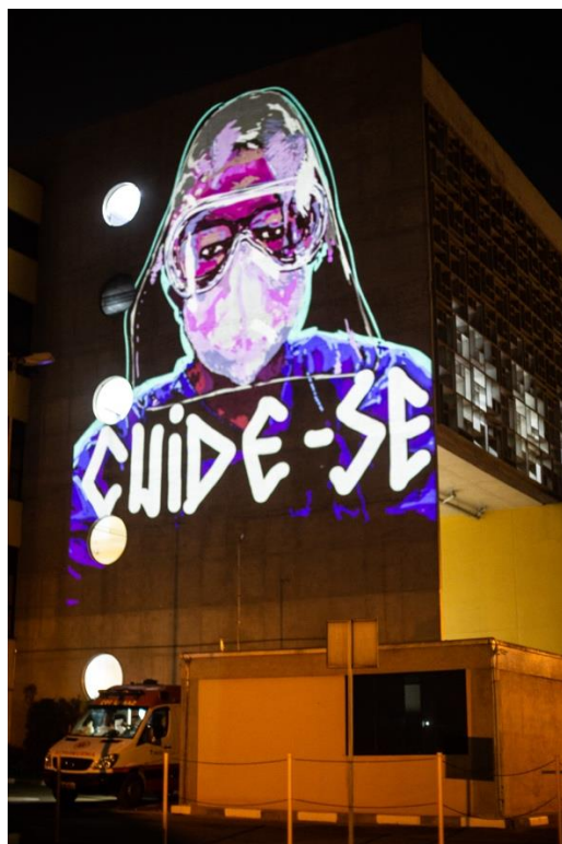
Figure 8: Cultura para heróis [Culture for Heroes], by Coletores Collective. Cidade Tiradentes Hospital, São Paulo (2020). Video mapping technique.

demonstrated by Coletivo Coletores' video-mapping projections depicting them. This emphasises the vital part that street art has played in generating substitute political accounts during Brazil's murky and reactionary government induced by the pandemic. (Figure 8)