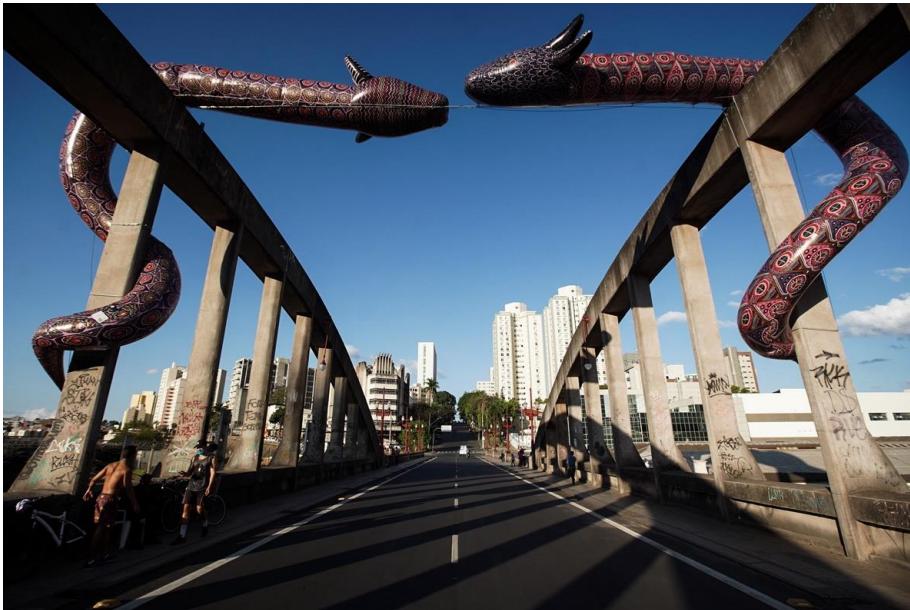
Figure 5 - Figure 5: Entidades [Entities], by Jaider Esbell (2021).

installation by the Indigenous artist Jaider Esbell, showcasing an enormous inflatable artwork named “Entidades” (Entities). This piece intertwined ancestral concepts with technology, featuring two inflatable snakes each measuring 17 meters in length and 1.5 meters in diameter. Designed as a site-specific sculpture for the arches of the Santa Tereza viaduct, the artwork was impressive. The exhibition presented the artist's investigation and poetic exploration of the "Cobra Grande" (Big Snake), a significant matriarchal archetype in indigenous cosmology. The depiction of the snake was a recurring theme in the artist's previous works. In this instance, the artist amplified the image to match the grand scale of the public space. The enigmatic sculptures hover within the area, with the snake's heads facing each other in a state of paradoxical serenity and weightlessness, while also evoking feelings of voracious anxiety and mutual consumption. The snake, whom the artist frequently referred to as the Universal Grandmother, has been recreated as a representation of a cautionary tale for humanity. The act of swallowing can be perceived as an opportunity for transformation and purification, rather than punishment. (Figure 5)