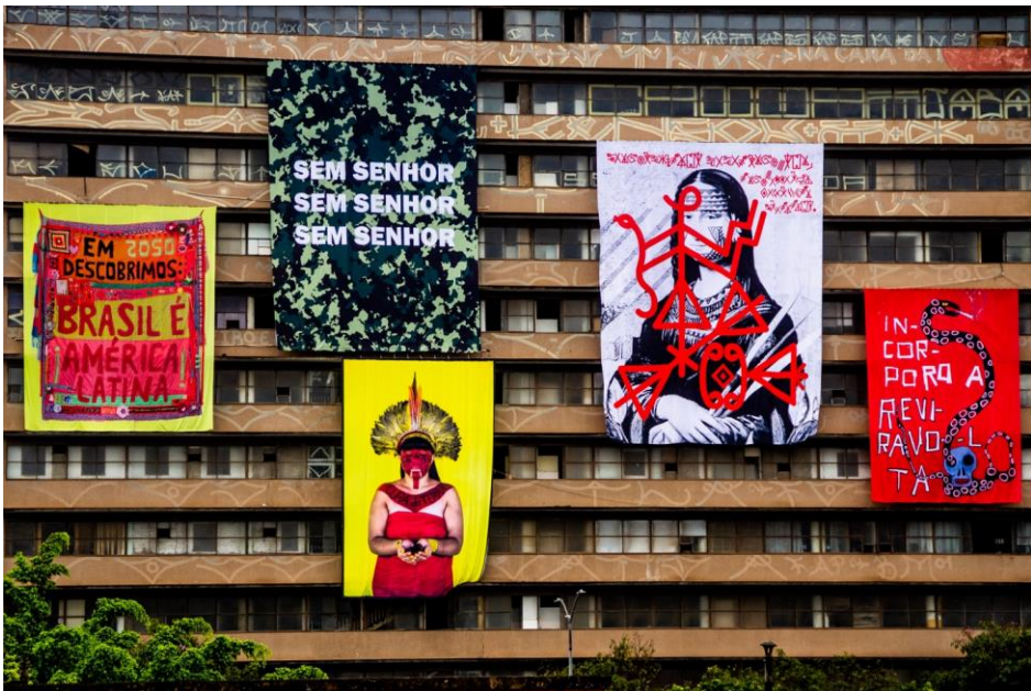
Figure 7 - Bandeiras na Janela [Flags at the Window], by Célia Xakriabá, Coletivo Cólera Alegria, Denilson Baniwa, Randolpho Lamonier and Ventura Profana, Fotógrafa. (2020). Courtesy of CURA

The "Bandeiras na Janela" installation, developed by the curatorial team of the 2020 CURA edition, involved five artists and collectives who decorated the former School of Engineering building at the Federal University of Minas Gerais (UFMG) in Belo Horizonte with flags. The artworks of Célia Xakriabá (MG), Denilson Baniwa (AM), Randolpho Lamonier (MG), Ventura Profana (BA), and Cólera Alegria (various) were faithfully recreated on a large scale, ranging in size from 100 to 210 square metres. Most of the flags focused on decolonial themes. The installation reflected the pandemic's setting, marked by social isolation, where windows of buildings and homes became the main and sometimes only link to the outside world. It also harnessed the historical use of flags as political communication tools and identity markers. In this case, the immense scale of the colossal flags on the building's façade surpasses the conventional idea of flags as mere symbols, transforming them into powerful visual statements. "Flags at the Window" remained exhibited publicly for 30 days. (See Figure 7).