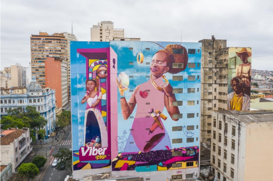
Figure 4 - Retorno [Return], by Lídia Viber (2020).

The festival promoted political resistance via art and prioritised the well-being of individuals and the environment. The decision was made to curate an exhibition that showcased authentic Brazil beyond the urban, gathering artists from varied regions, each with unique aesthetic perspectives diverging from the customary approaches in urban art interventions. "It is crucial to consider perspectives that suggest alternative paths," stated the exhibition curators. 6 During both editions amid the pandemic, CURA also showcased works from Amazonian artists, which adorned the walls along Avenida Amazonas in Belo Horizonte, thus fostering a link with the region and its people. This initiative inspired the organizers of the event to launch "CURA AMAZÔNIA" in 2023, in Manaus, the capital of the Amazonas state. This action has confirmed their dedication to expanding urban art into uncharted territories, stimulating collective imagination, transforming urban environments, and fostering social connections through art. In Manaus, CURA revealed two enormous murals and a public art installation that honours the heritage, resilience, and jubilation of the forest's inhabitants.